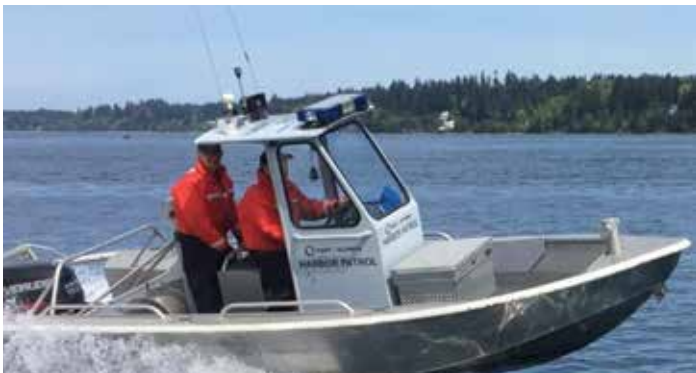
• Marine Public Safety: Harbor Patrol