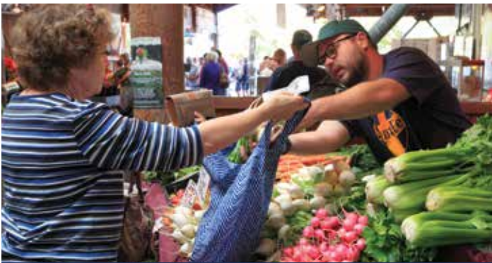
• Prime location for the Olympia Farmers' Market