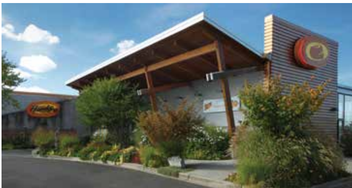
• $300 million in annual business revenue