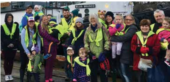
• Free tours for all Thurston County schools, including transportation to and from Port.